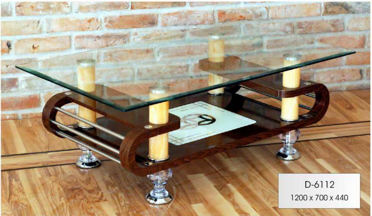
GLASS 1350 x 800 ≠ 10 UNTEMPERED