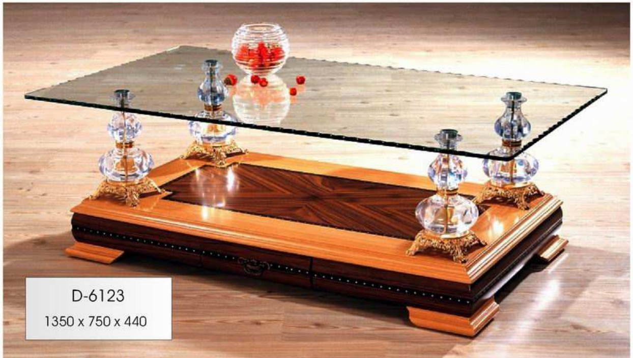
GLASS 1200 x 700 ≠ 10 TEMPERED