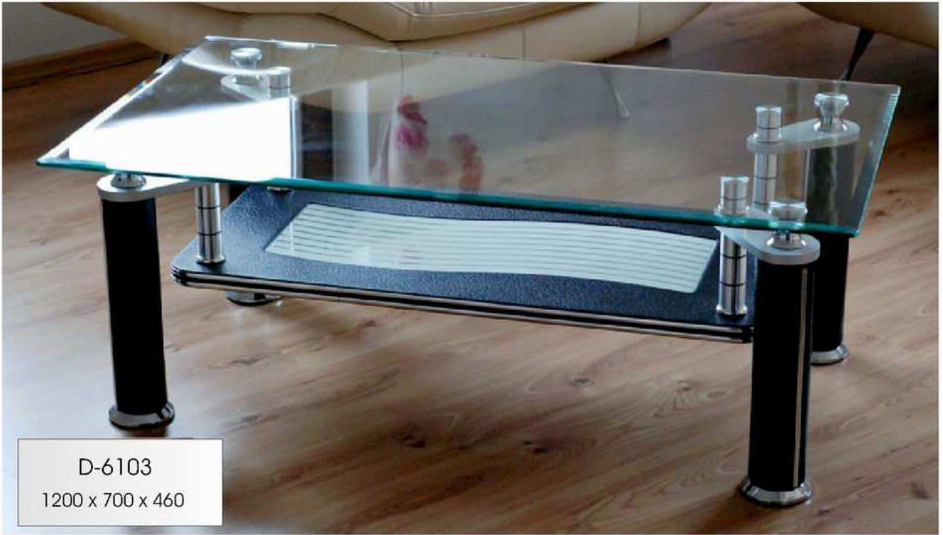
D-6103 1200 x 700 x 460