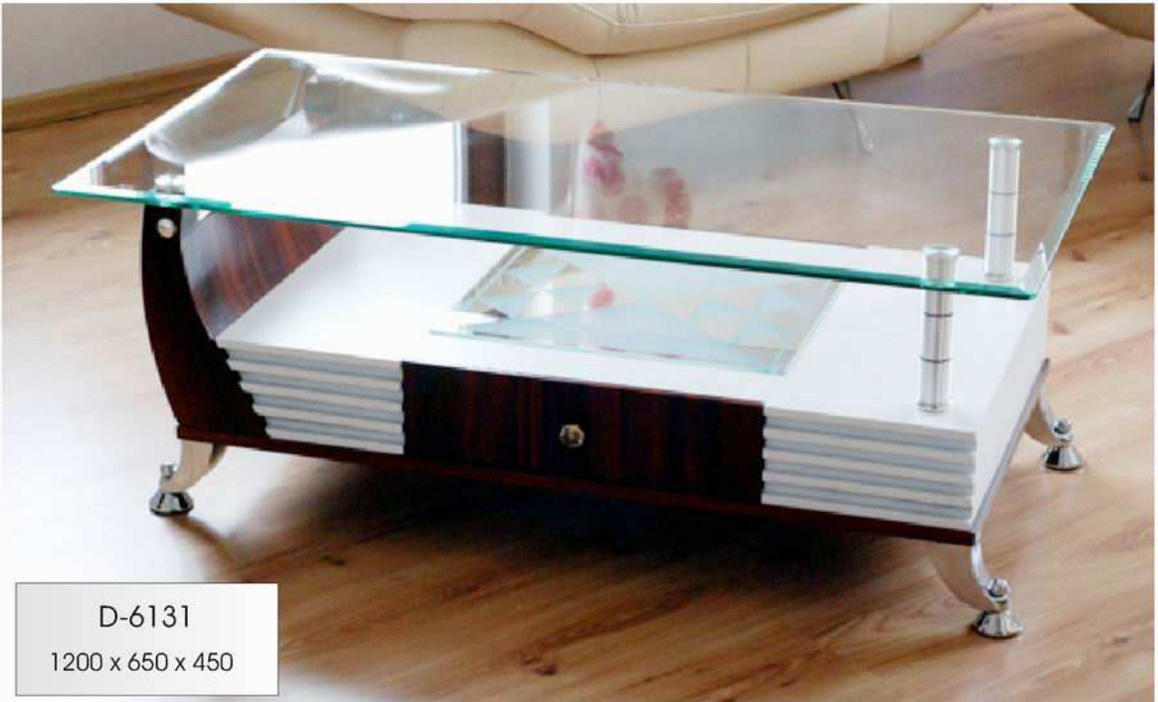
D-6131 1200 x 650 x 450