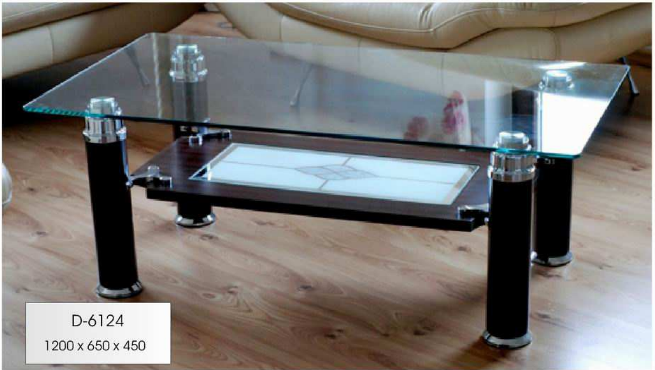
D-6124 1200 x 650 x 450