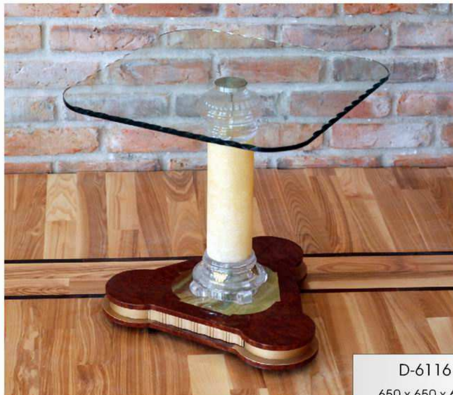
D-6116 650 x 650 x 640