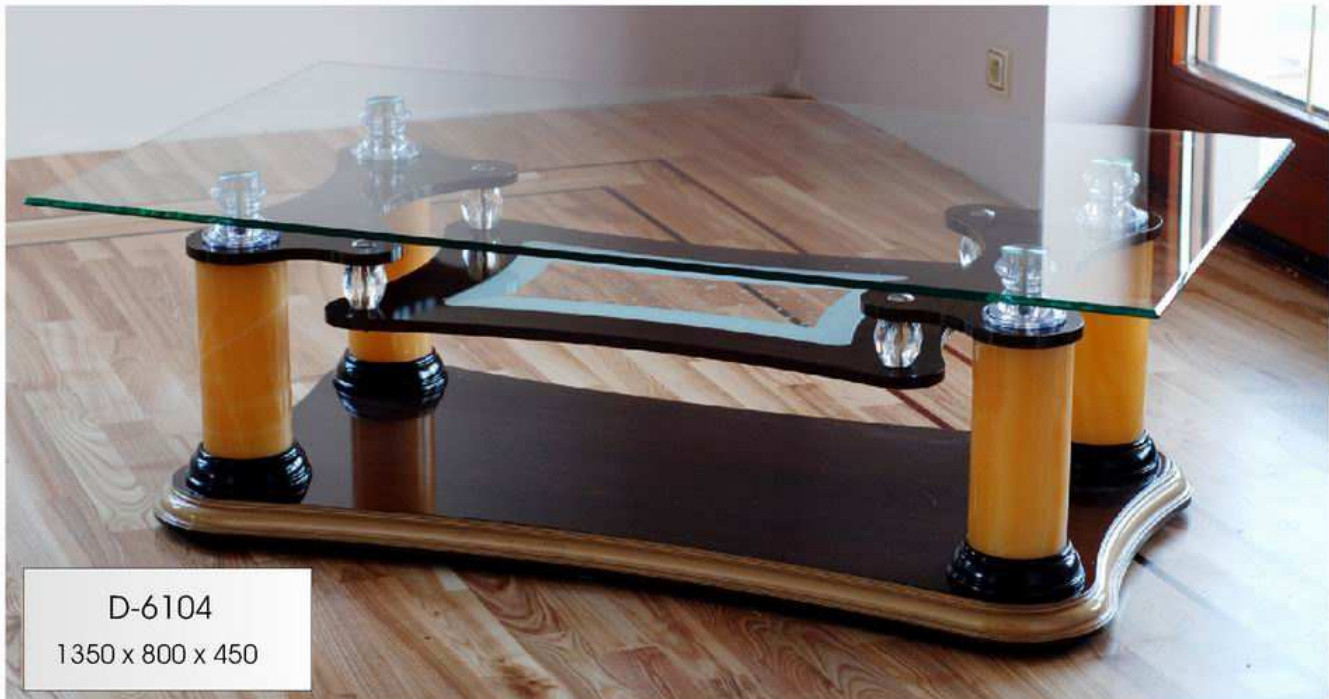
D-6104 1350 x 800 x 450