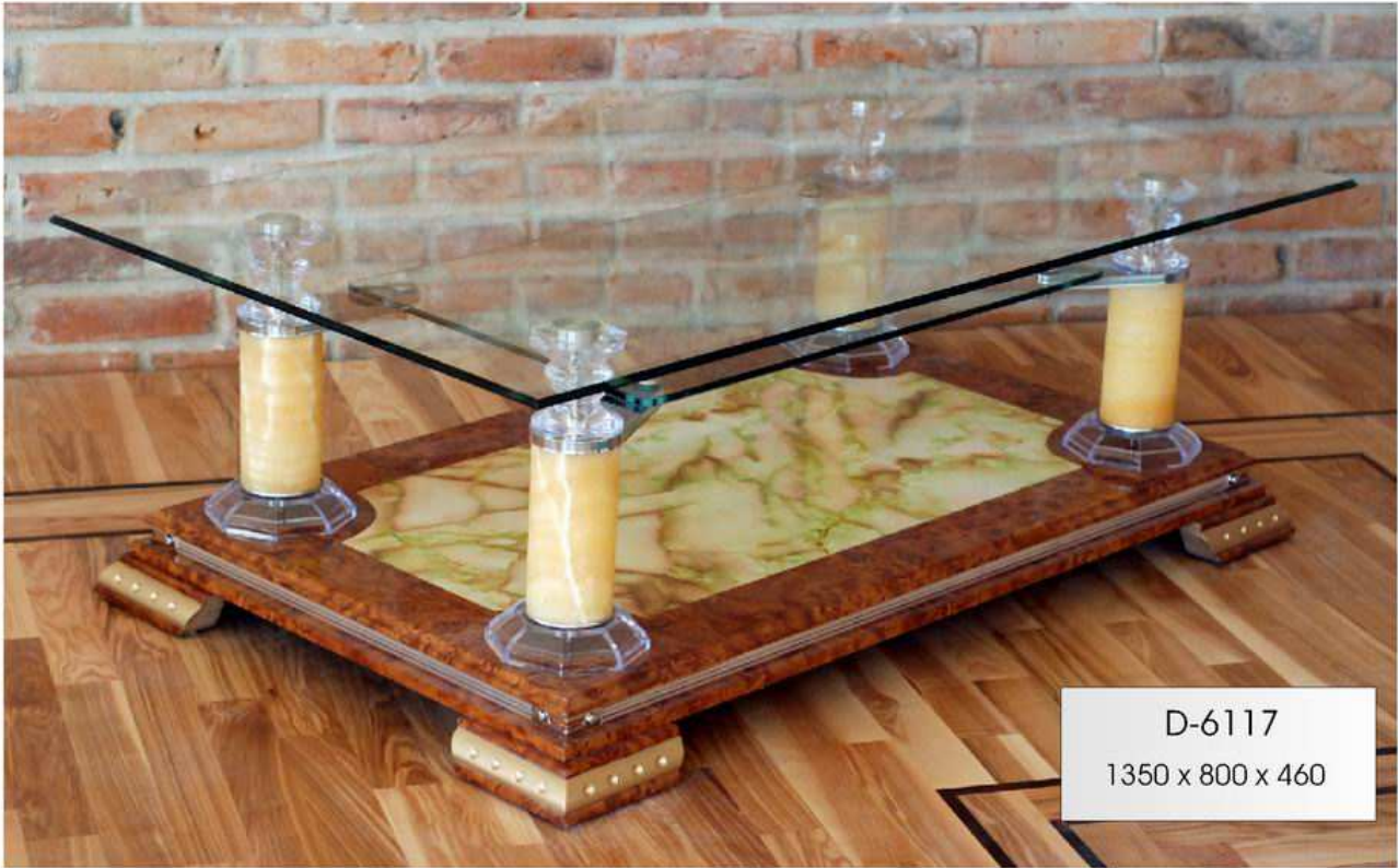
GLASS 1350 x 800 ≠ 10 TEMPERED