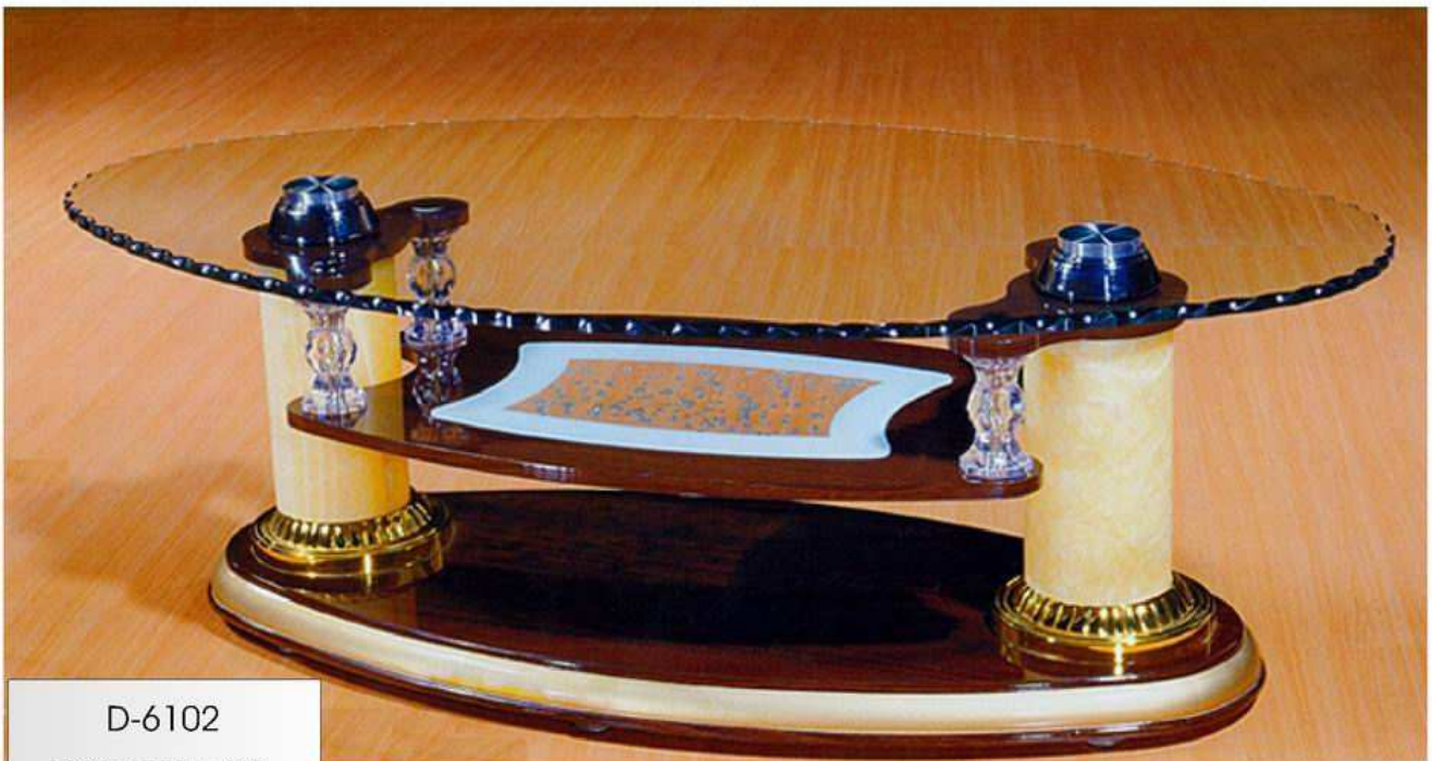
D-6102 1300 x 750 x 460