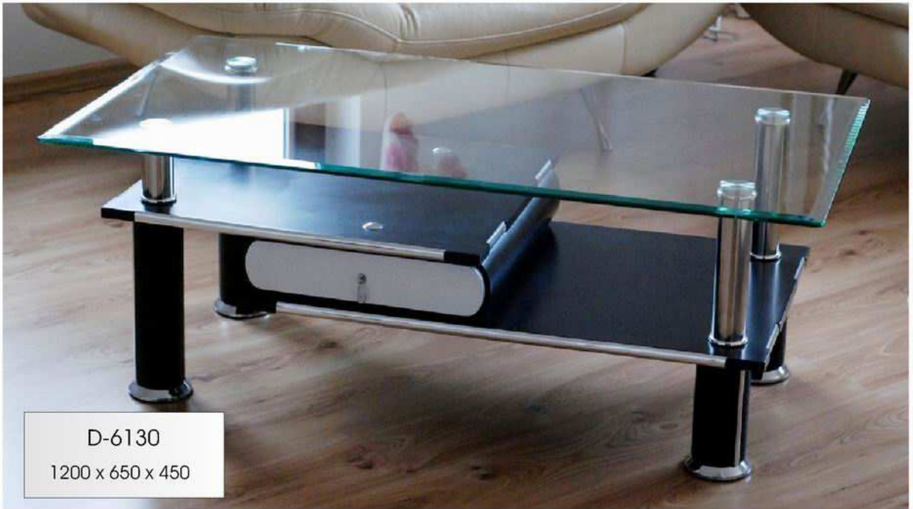
D-6130 1200 x 650 x 450