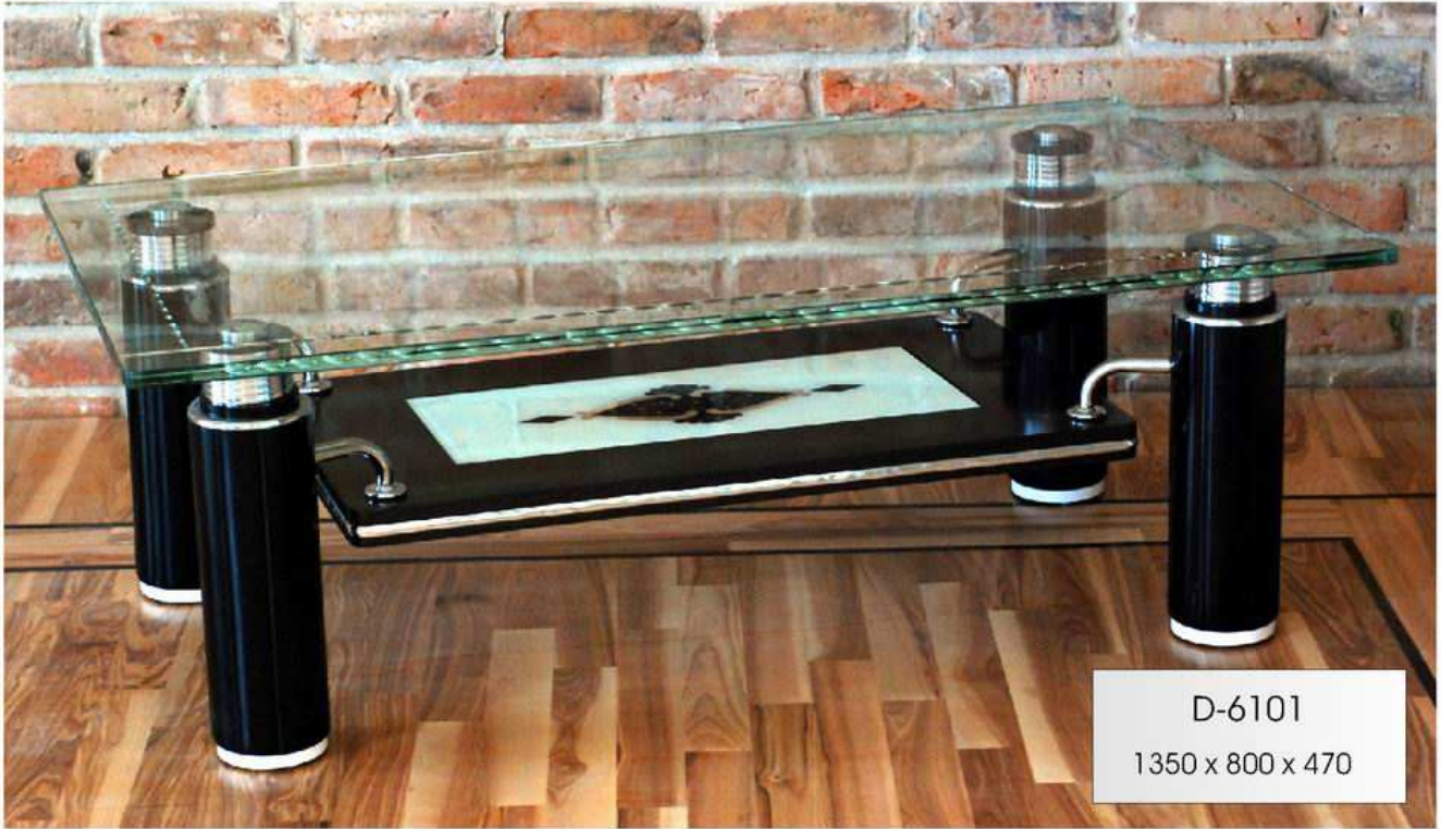
D-6101 1350 x 800 x 470