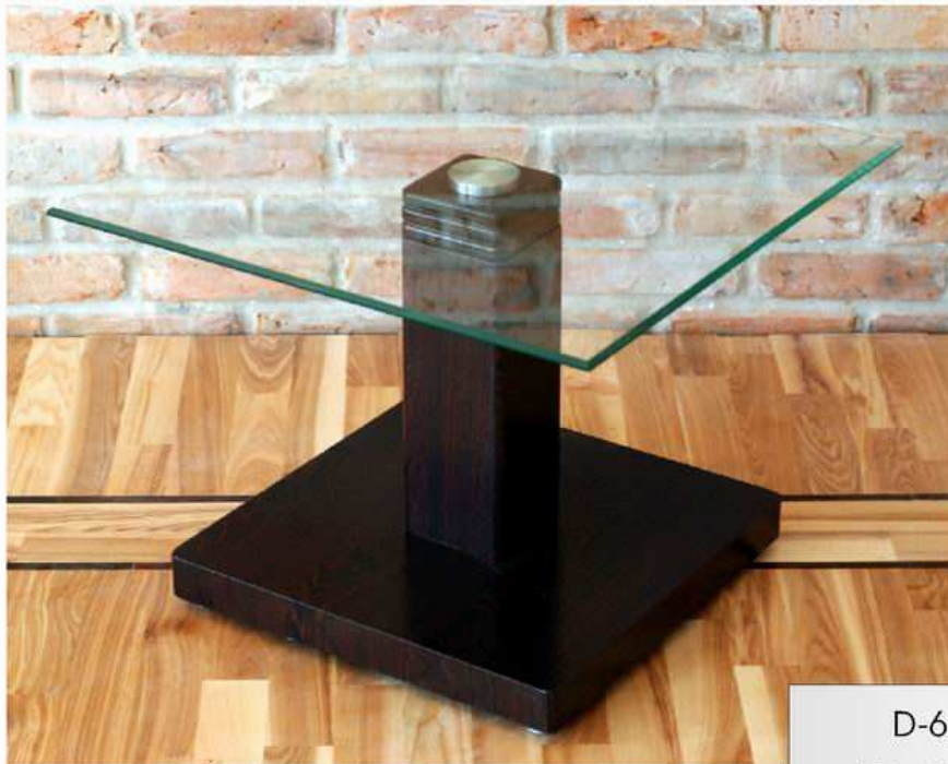
D-6121 650 x 650 x 490