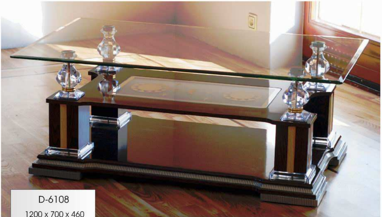
D-6108 1200 x 700 x 460