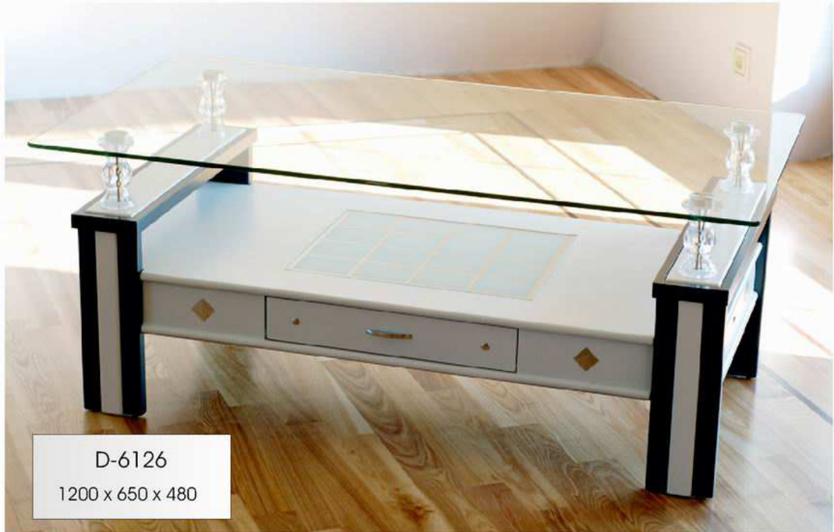
D-6126 1200 x 650 x 480