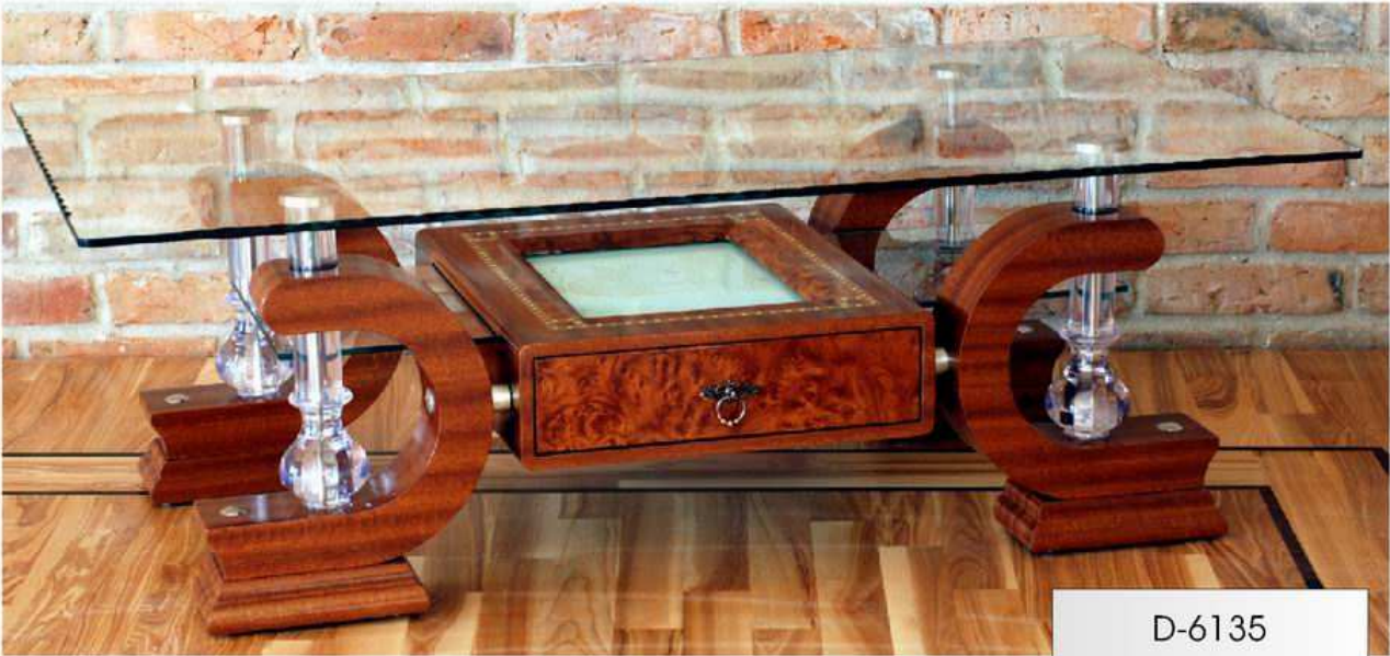
D-6135 1350 x 800 x 460