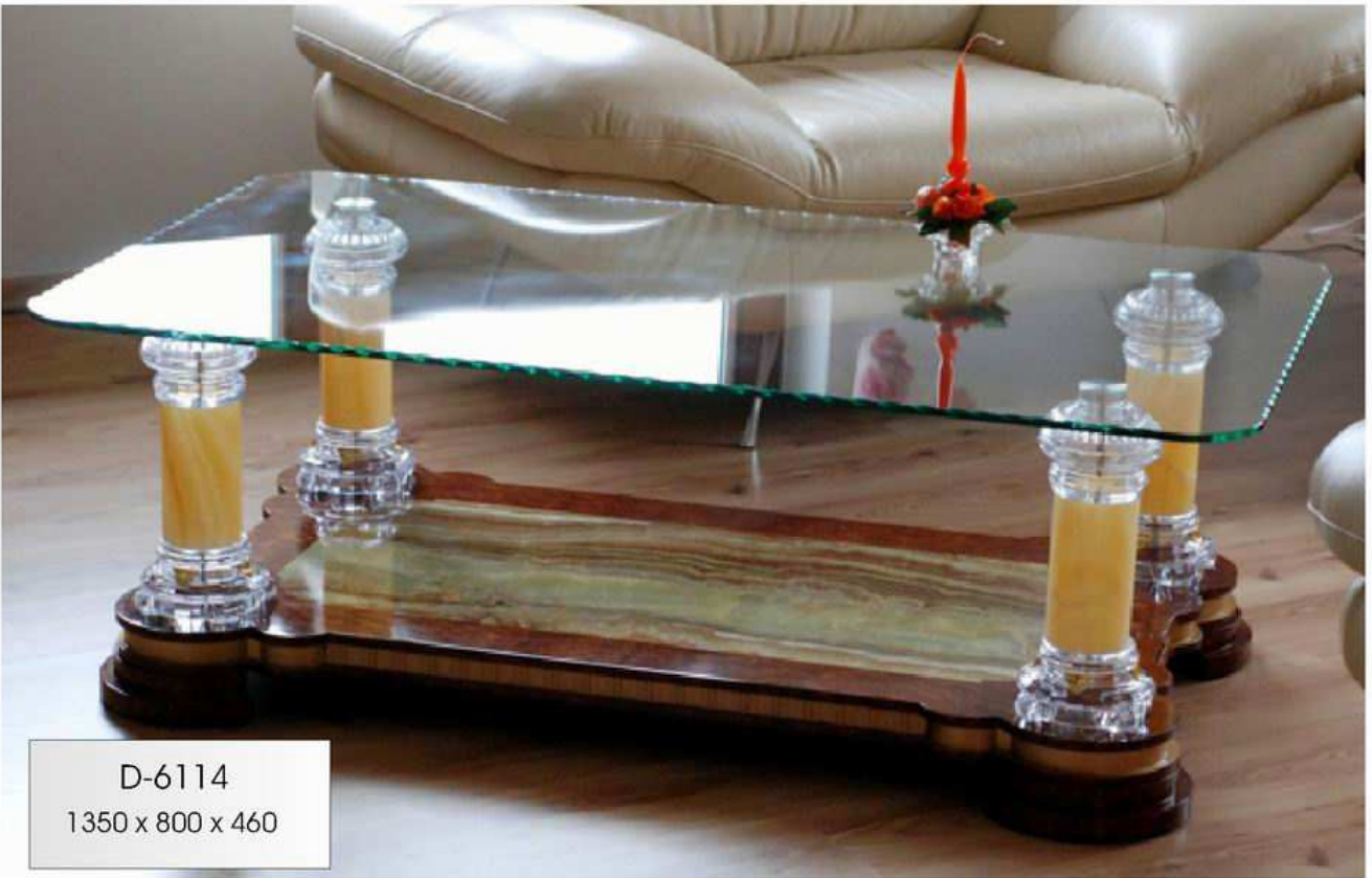
GLASS 1300 x 750 ± 10 TEMPERED