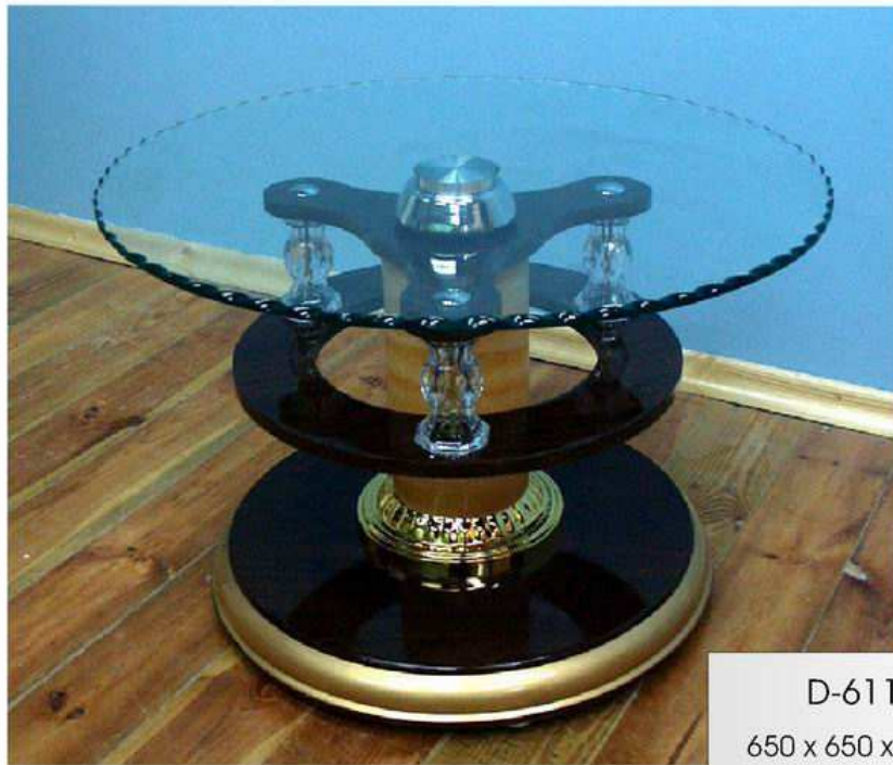
GLASS 650 x 650 ≠ 10 TEMPERED