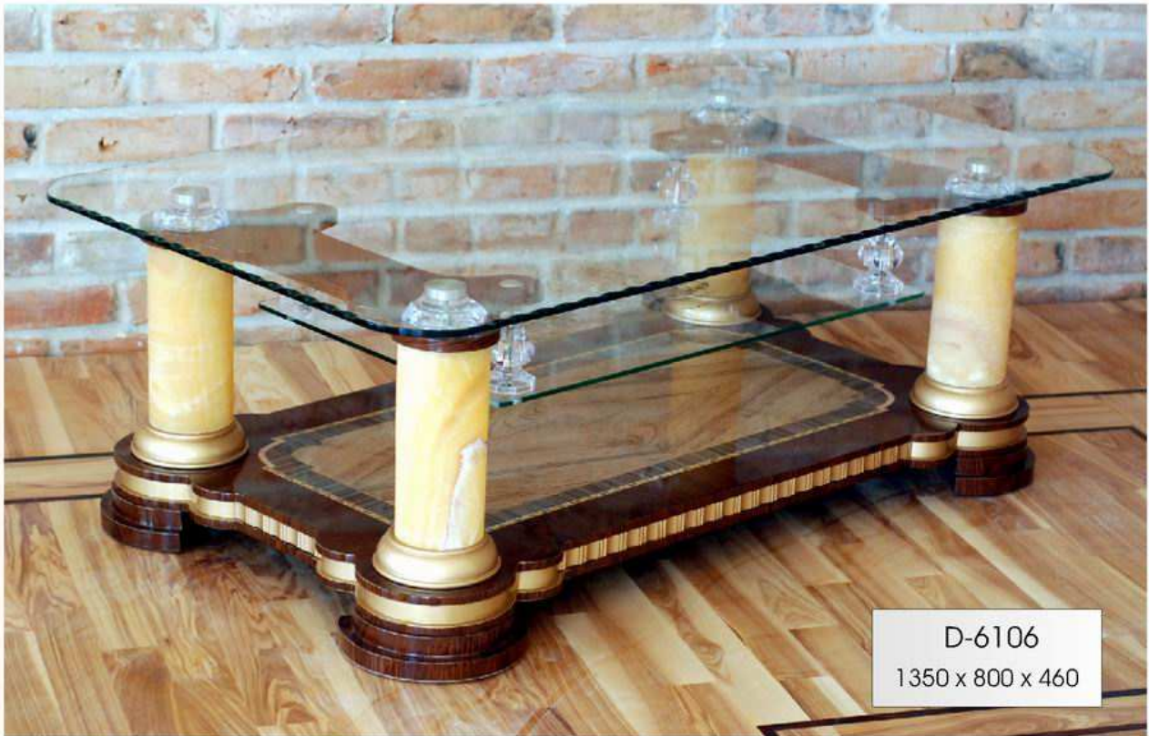
D-6106 1350 x 800 x 460