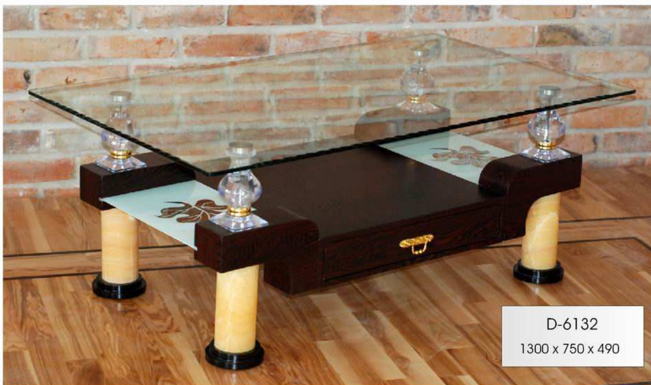
D-6132 1300 x 750 x 490