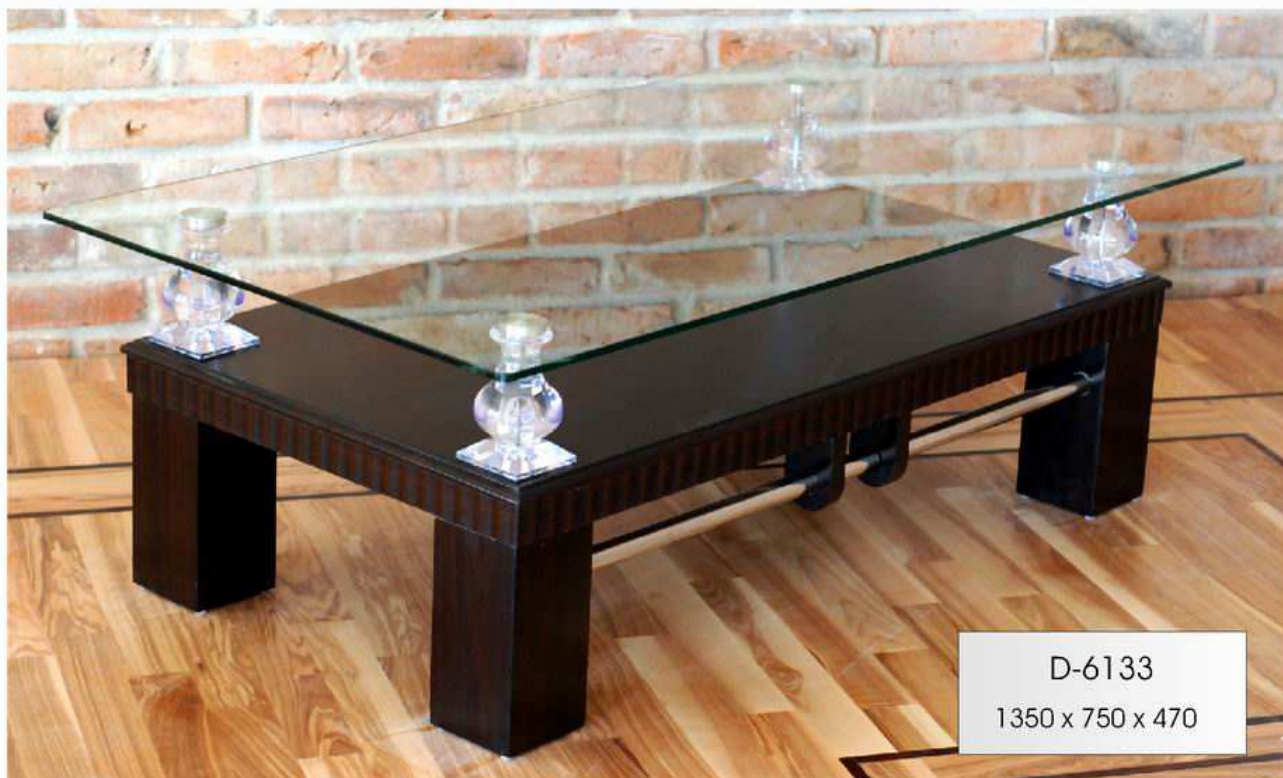
D-6133 1350 x 750 x 470