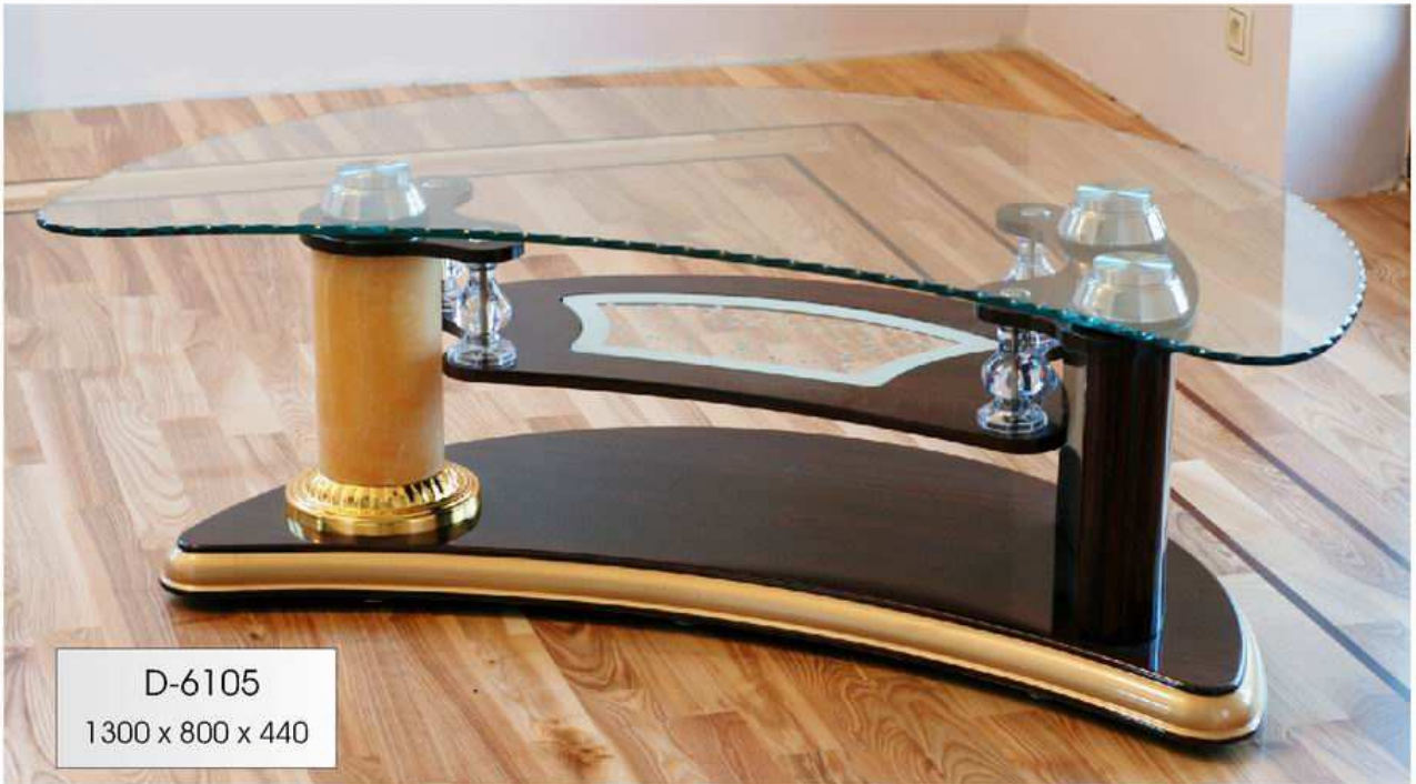
D-6105 1300 x 800 x 440