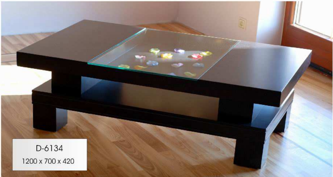
D-6134 1200 x 700 x 420