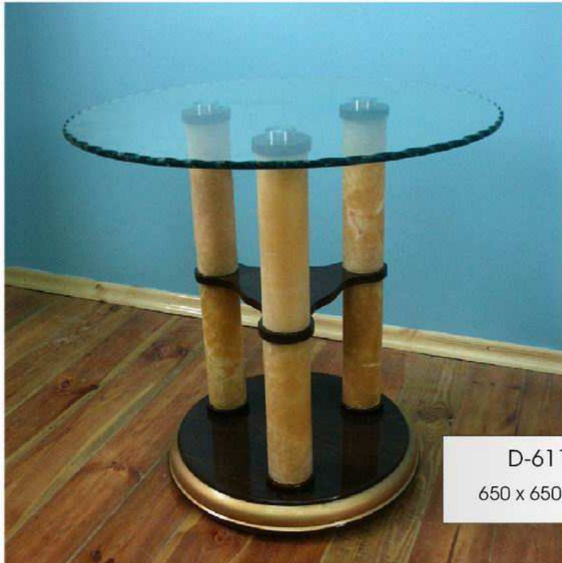
D-6115 650 x 650 x 500