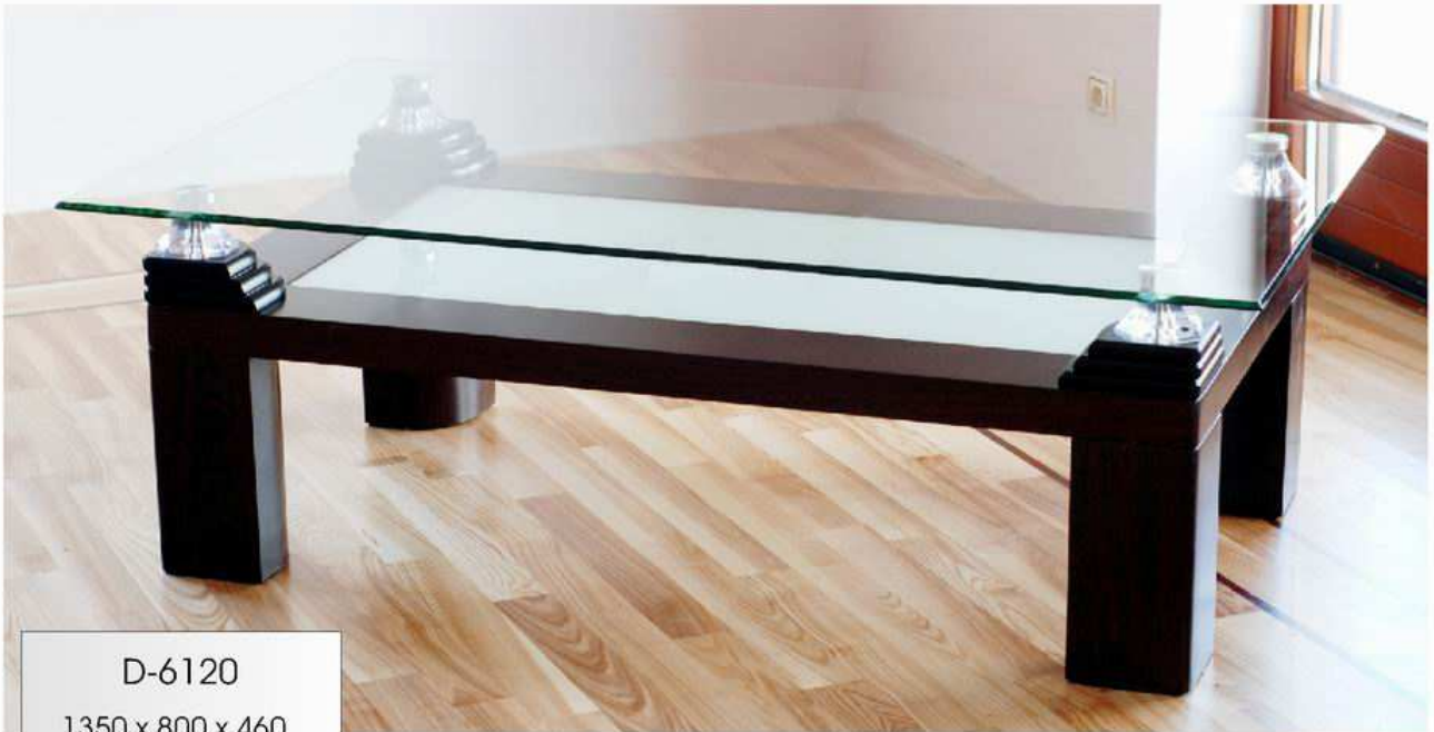
D-6120 1350 x 800 x 460